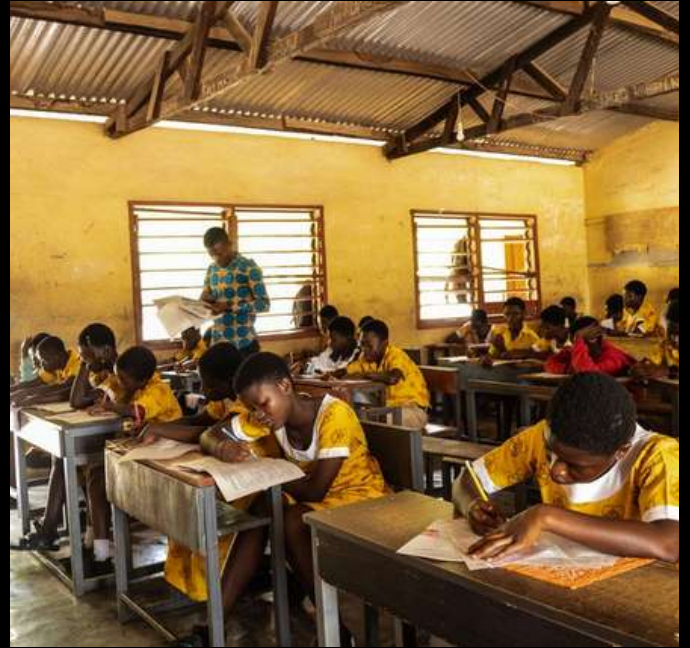
Visit to a school