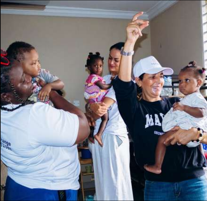
Visit to Orphanage