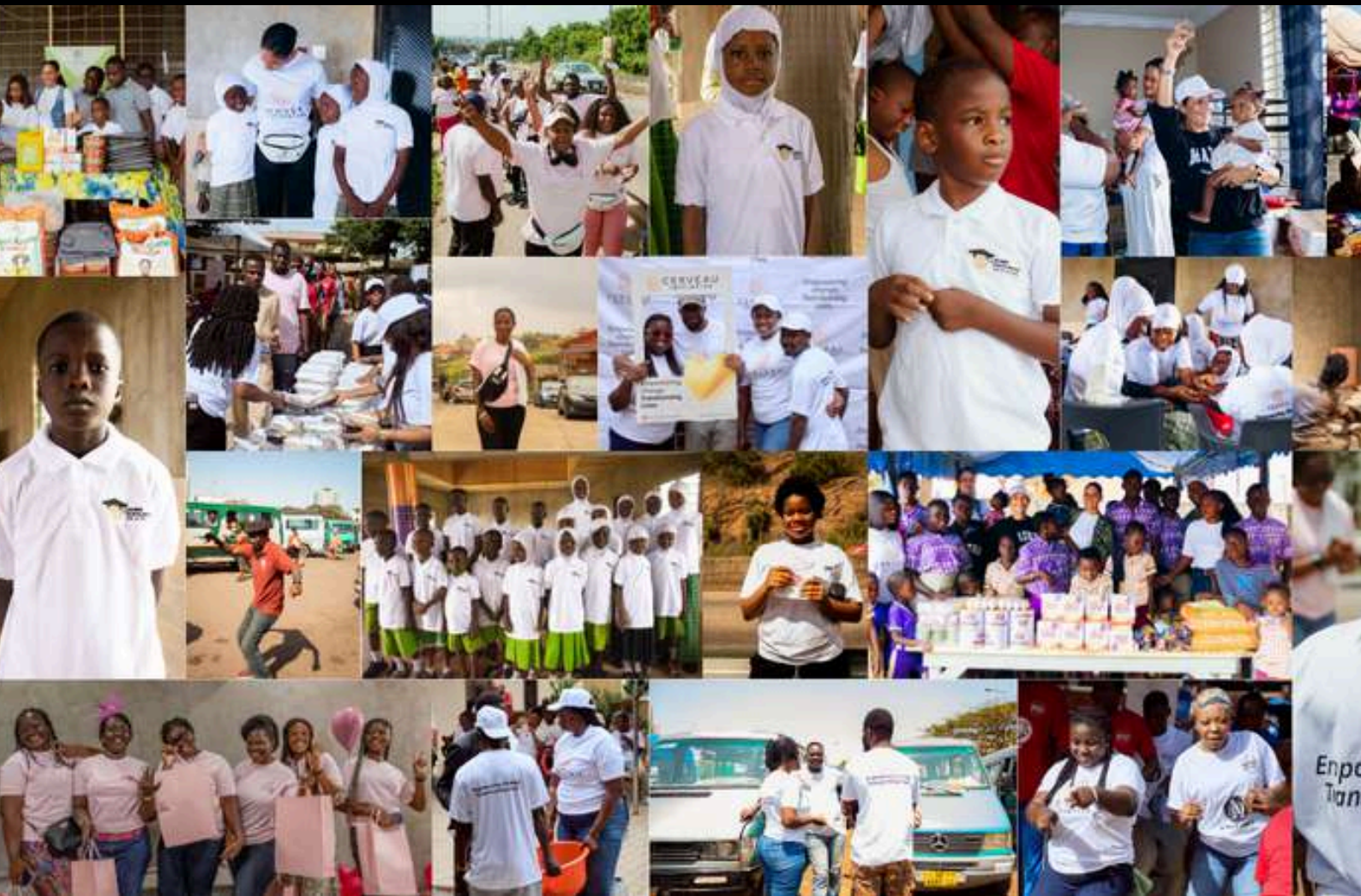
A look back at our work throughout the year 2025