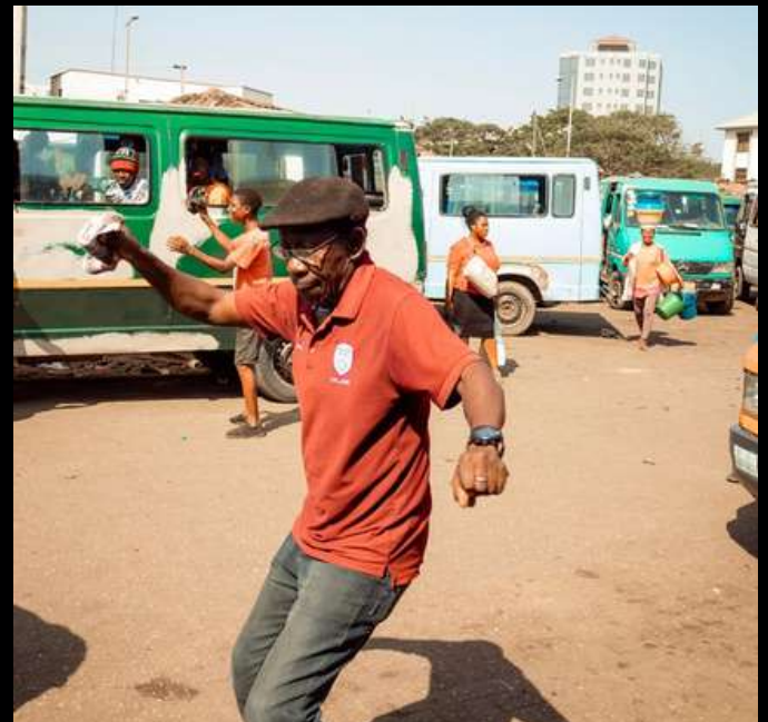
Market Awareness Campaign